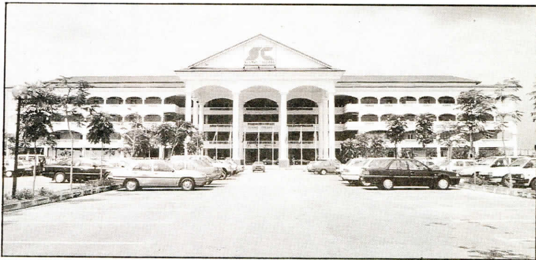
The new RM120 million 22-acre campus of Sunway College